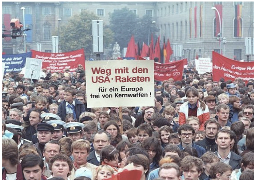
Algemeen Handelsblad, Amsterdam